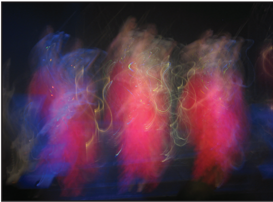
Cover Photo: Aura 3 Women Fiddlers